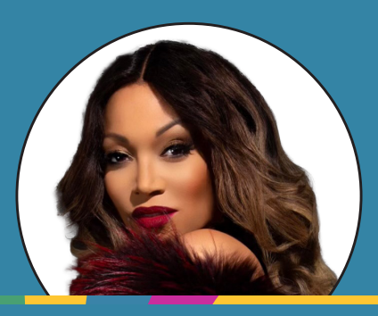
Chante' Moore Singer & Songwriter